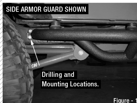
Figure - 1